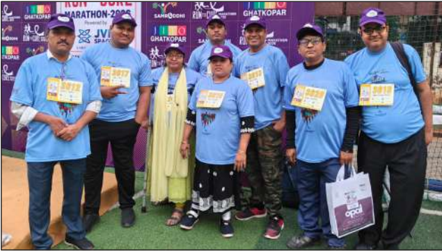
1. Bindu team members actively participated in a marathon event in Pune.